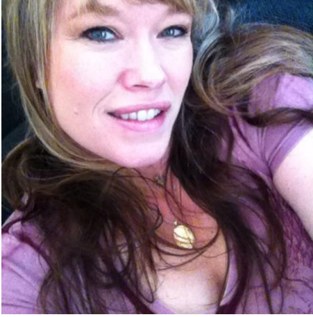
~ Holly Stafford HollysImages.com